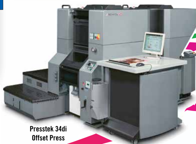
Presstek 34di Offset Press

Four-color printing refers to the four color plates - cyan, magenta, yellow, and black (CMYK) - that are used in offset printing presses and most digital presses. These four colors are combined in formulas to make up a range of colors.